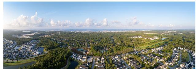
Watersound Origins community