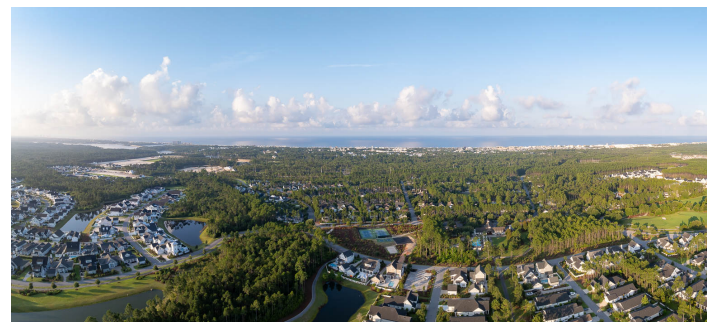
Watersound Origins community